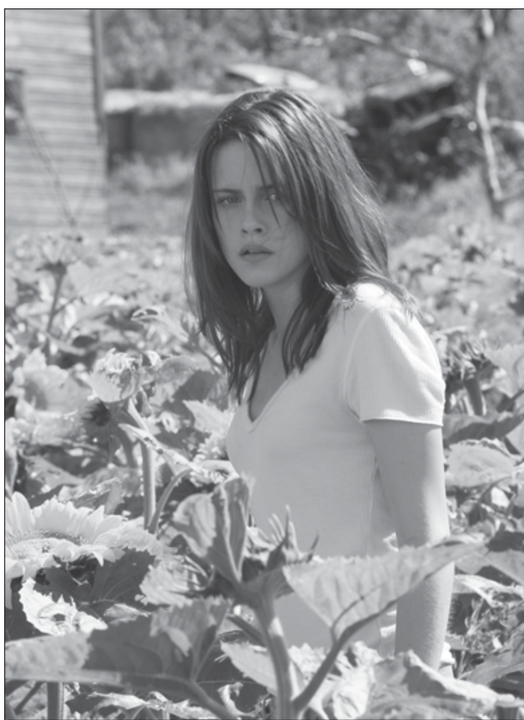
Kristen Stewart stars in "The Messengers."

Bow Tie Cinemas Landmark 9, 5 Landmark Square, 324-3100 Blood and Chocolate: 12:40, 3:50, 6:20, 8:50 Blood Diamond: 4:05, 9:50 Dreamgirls: 1:20, 4:10, 7:05, 9:55 Epic Movie: 1:30, 3:40, 5:50, 8, 10:10 Freedom Writers: 1:10, 7:10 The Good Shepherd: 12:30, 3:45, 7 The Hitcher: 10:10 The Messengers: 1, 3:10, 5:20, 7:30, 9:40 The Pursuit of Happiness: 1:25, 4, 6:40, 9:30 Smokin' Aces: 2, 4:40, 7:15, 10:05 Stomp the Yard: 12:50, 4:20, 6:50, 9:20 Bow Tie Cinemas Majestic, 118 Summer St., 323-1690 Because I Said So: 1:30, 4:30, 7:30, 10 Catch and Release: 1:45, 4:45, 7:45, 10:15 The Last King of Scotland: 4:15, 7:15, 9:55 Letters from Iwo Jima: 12:30, 3:45, 6:45, 9:55 Night at the Museum: 12:45, 3:45, 6:30, 9:15 Seraphim Falls: 1:15 Venus: 1, 3:30, 5:45, 8, 10:15 State Cinema, 990 Hope St., 325-0250 Babel: 3:50, 8:40