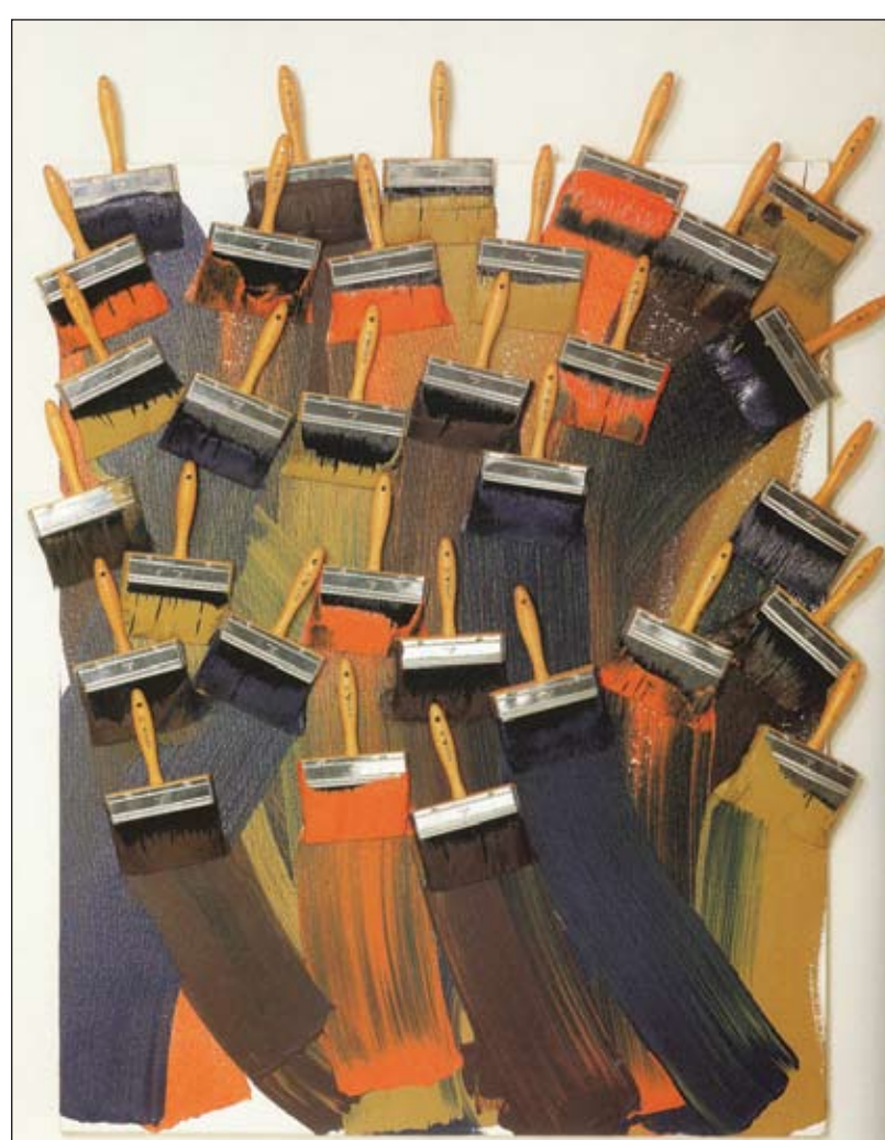
"Blue, Red, Brown" by Arman.