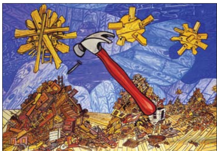
"I Nailed Wooden Suns to Wooden Skies" by Red Grooms.