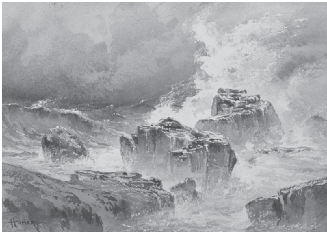
"Maine Coast," by an unknown artist in the manner of Winslow Homer, above, and a reproduction of "Repas Frugal" by Pablo Picasso, below.

After considerable time and much paperwork, the FBI finally agreed to let the museum forgeries of artists Willem de Kooning, Jean-Michel Basquiat and Andy Warhol. The exhibit has 60 examples of Western paintings, works on paper, sculpture and decora-