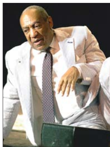
Tom Wolfe, left; Bill Cosby, above; and Wynton Marsalis are featured in the Stamford Center for the Arts' new season.