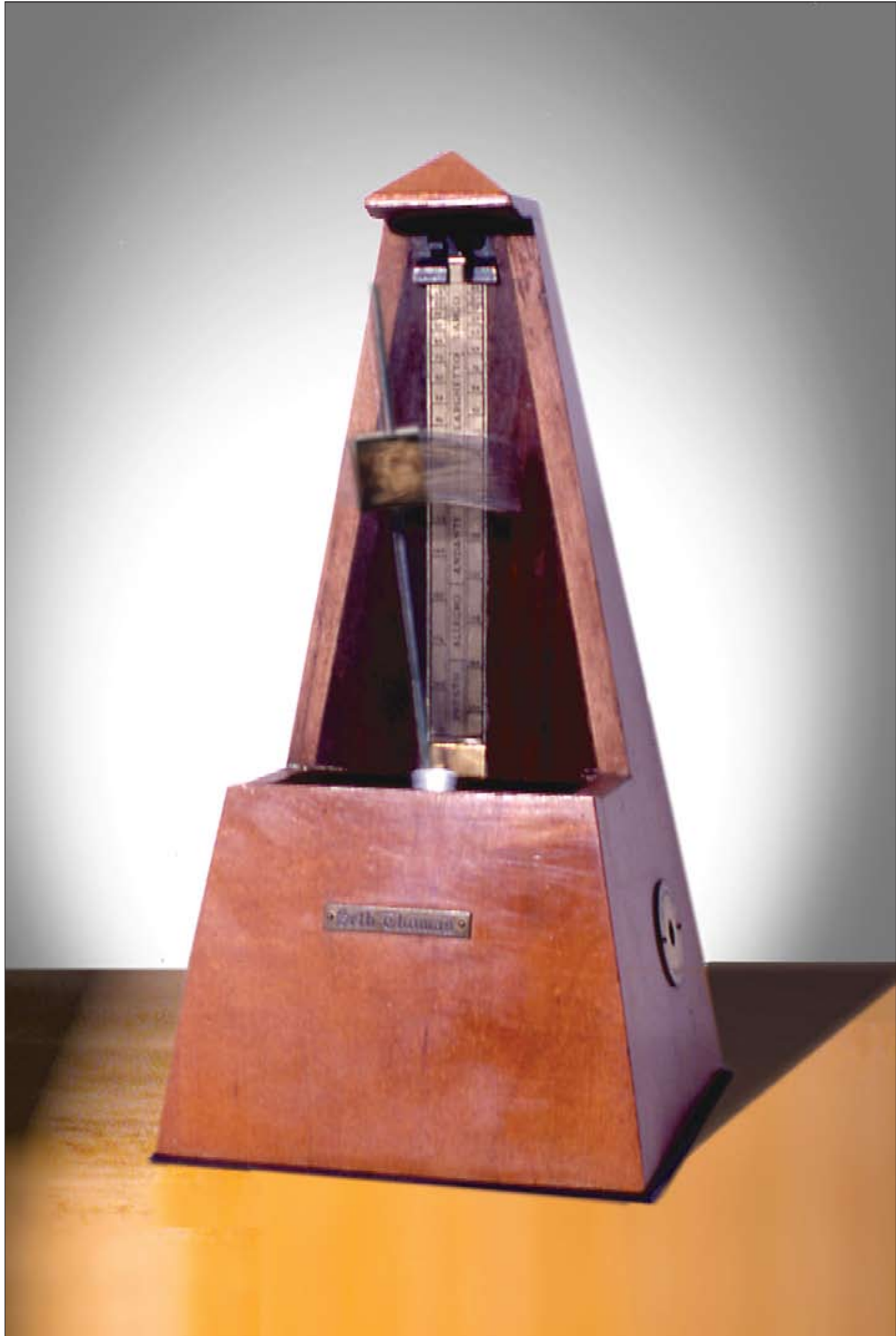
The metronome from "History's Garden."

In a separate space, Char Davies's "Osmose/Ephémère," is a virtual reality work that requires the visitor to put on a vest and helmet containing sensors. It