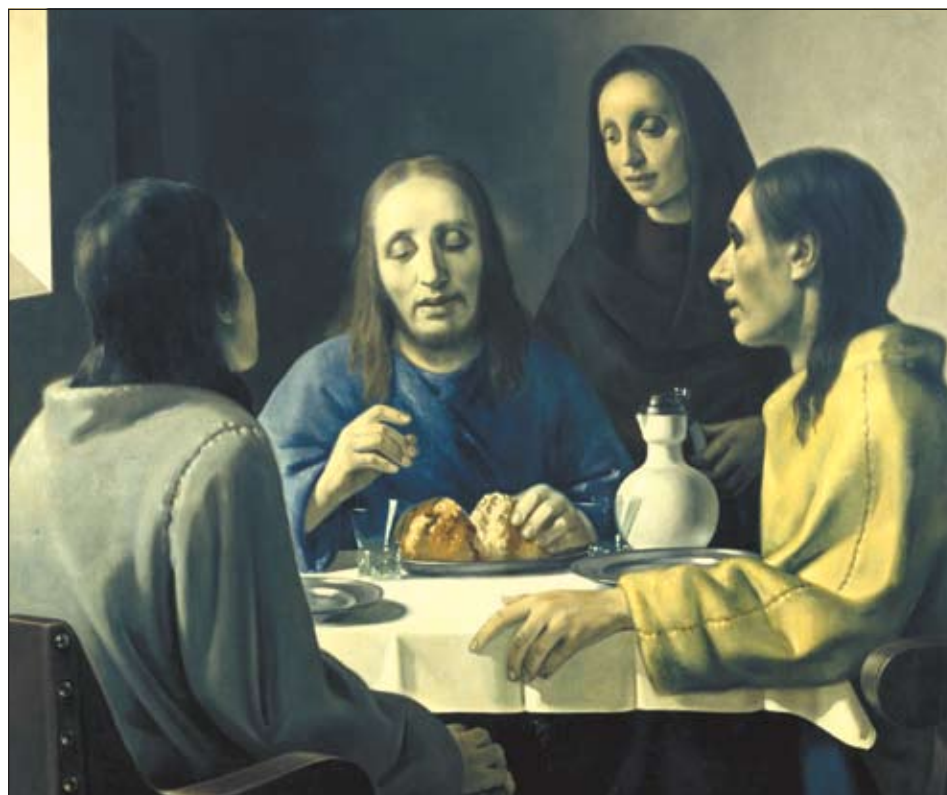
Contributed photos "Christ and His Disciples at Emmaus" by Han van Meegeren, in the manner of Joseph Vermeer. At right is an unauthorized print based on "The Discovery of America by Christopher Columbus" by Salvador Dali.