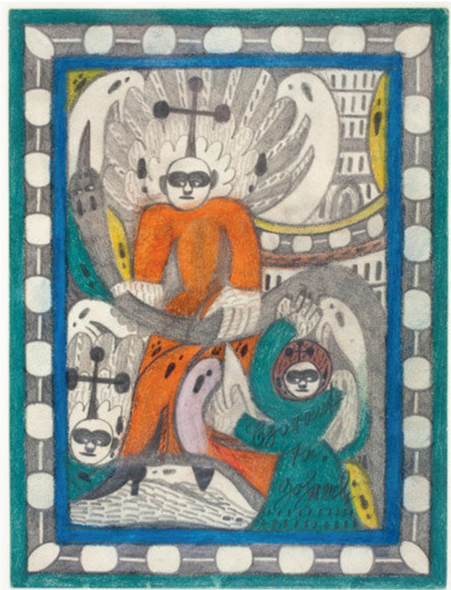
Adolf Wölfli. Courtesy of the Outsider Art